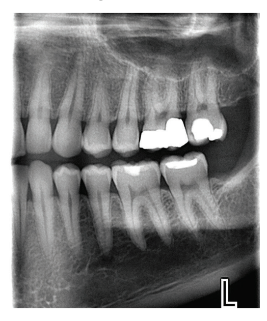
Approximately 1/2 the radiation of 2 traditional 2D intraoral bitewing series.<sup>1</sup>