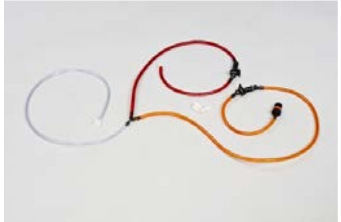
Dual Diverter Valve System