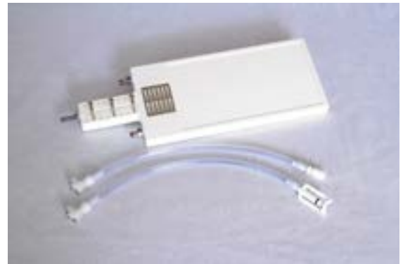
ProStation Heated Workstation