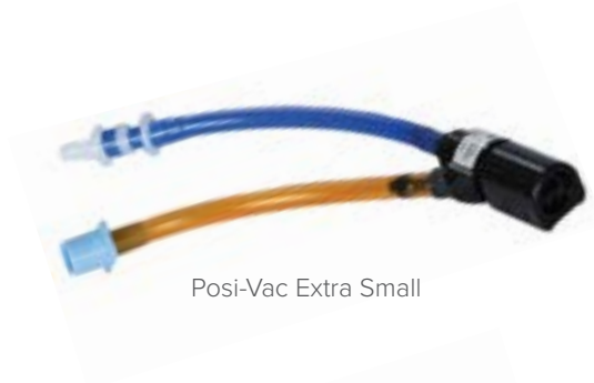
Posi-Vac Extra Small

Shroud 1-1/2" / Nosecone 1-1/4" 07-8914729