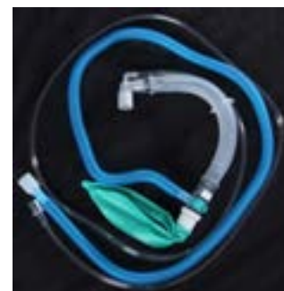
MJR Style Non-Rebreathing Circuit (with 1/2 liter bag)