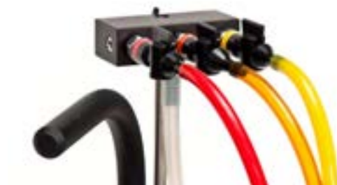
Tri Diverter Manifold