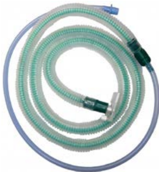
60" Bain Style Non-Rebreathing Circuit (CPRAM)