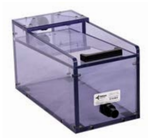
Vapor-Vac Hooded Induction Chamber