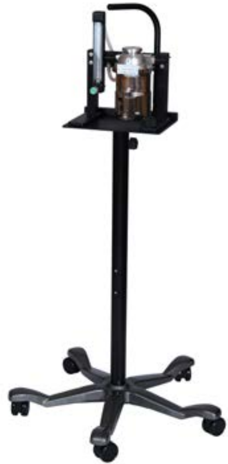
Compact Convertible Anesthesia System