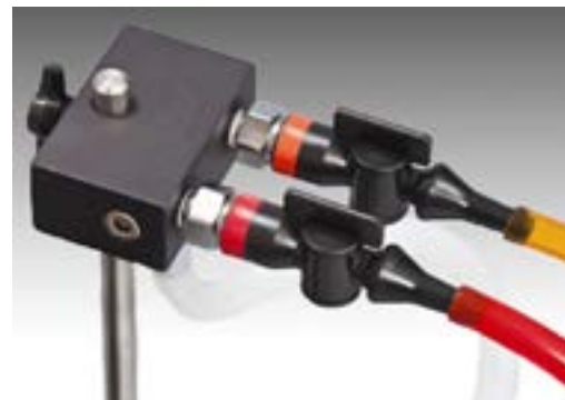
Dual Diverter Manifold