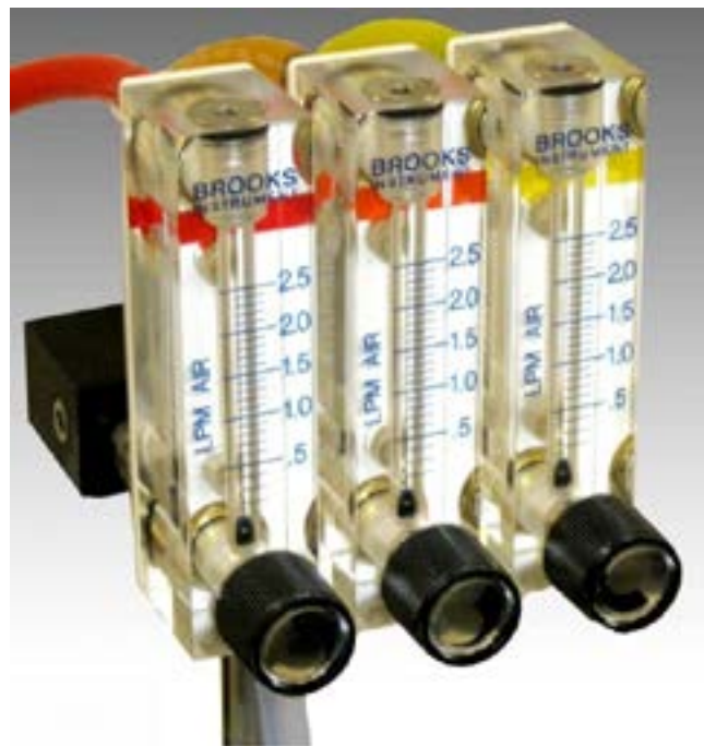
Multiplex Delivery System (MDS)