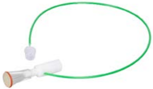
Universal Rodent Nosecone NRB System