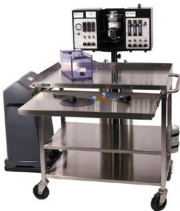
Mobile LAAB Elite (shown with optional components)