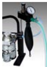
Mounted on PAM