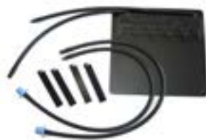
EquaFlow 5 Low Profile