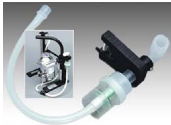
Humidifier for Long-Term Rodent Anesthesia