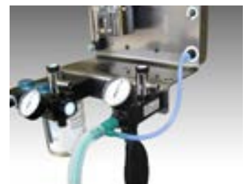
Mounted on Versa II