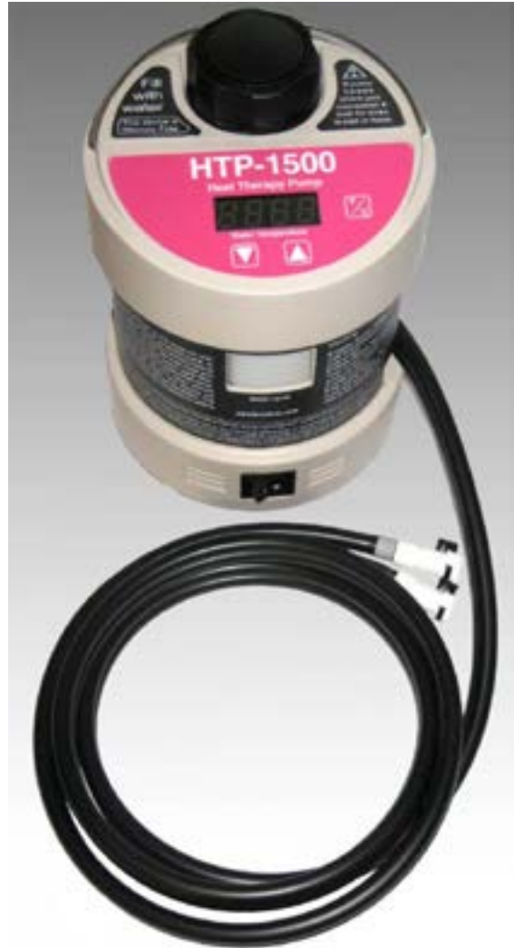
Adroit Medical HTP-1500