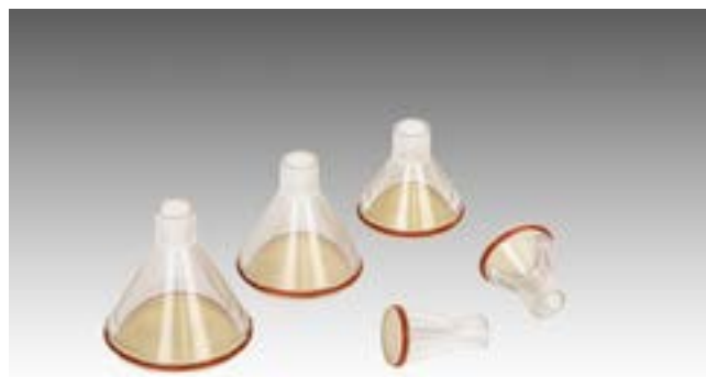
Rodent Face Masks