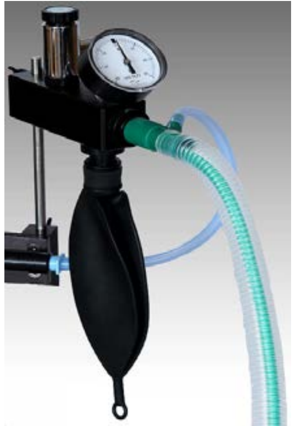
Bain Style Non-Rebreathing Circuit Block