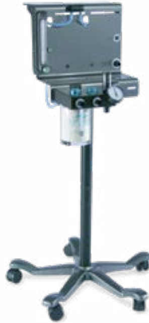
Versa II Anesthesia System

Fixed Wall-Mount Anesthesia Machine Versa II 78932647