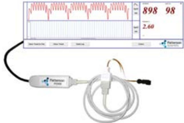
Cable Oximeter – Patterson PS900

PS900 Cable Oximeter - Veterinary (for use with rabbits, cats, dogs) Includes: PS900 Cable Oximeter, Oximetry Y Sensor with clip, and Sensor Oximetry Reflective 78938074