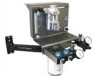
Versa II on Swivel Wall-Mount Bracket