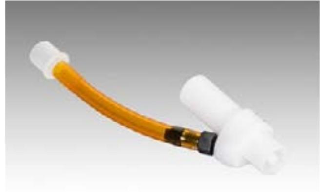
Mapleson-D Non-Rebreathing System