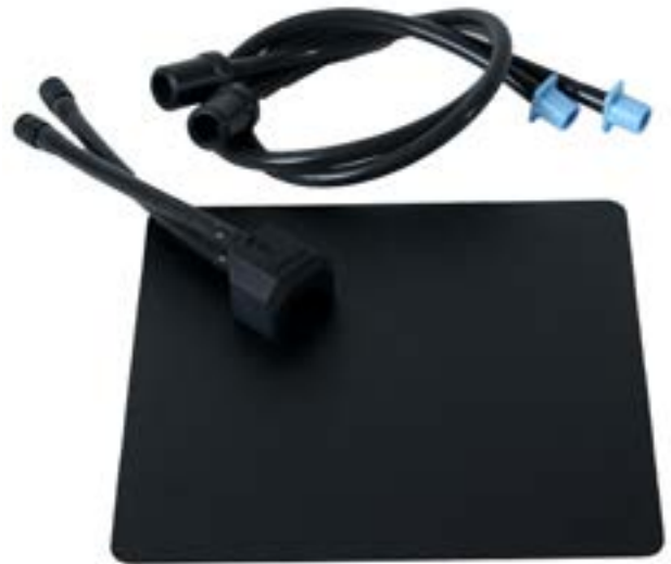
Uniflow Single Manifold

1.125" H x 1.562" W x 1.375" D 07-8924212