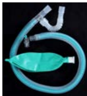
F-Style Rebreathing Circuit (40" with 2 liter bag)