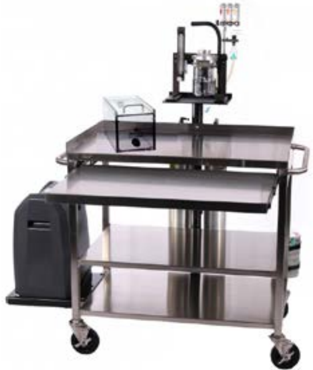
Mobile LAAB (shown with optional components)