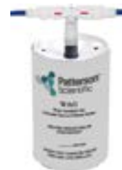
WAG Canister with "T" Adapter