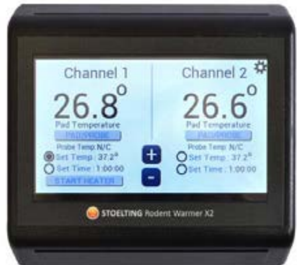
Rodent Warmer X2 System