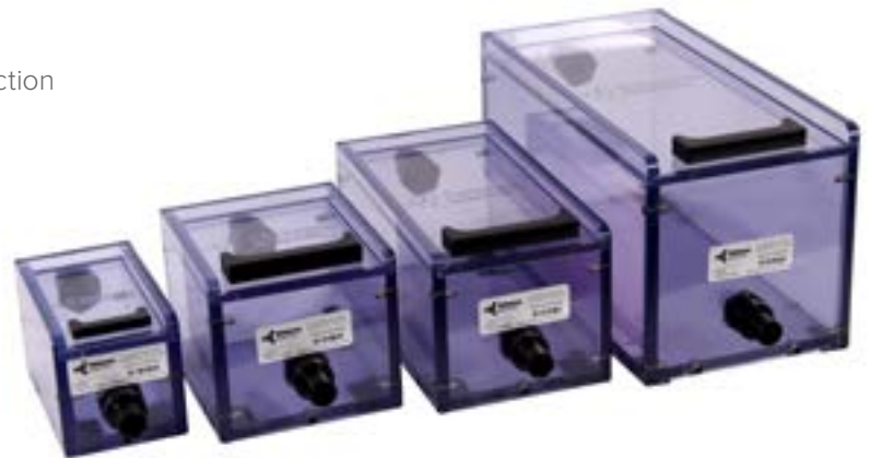
XX-Small Single Mouse Chamber